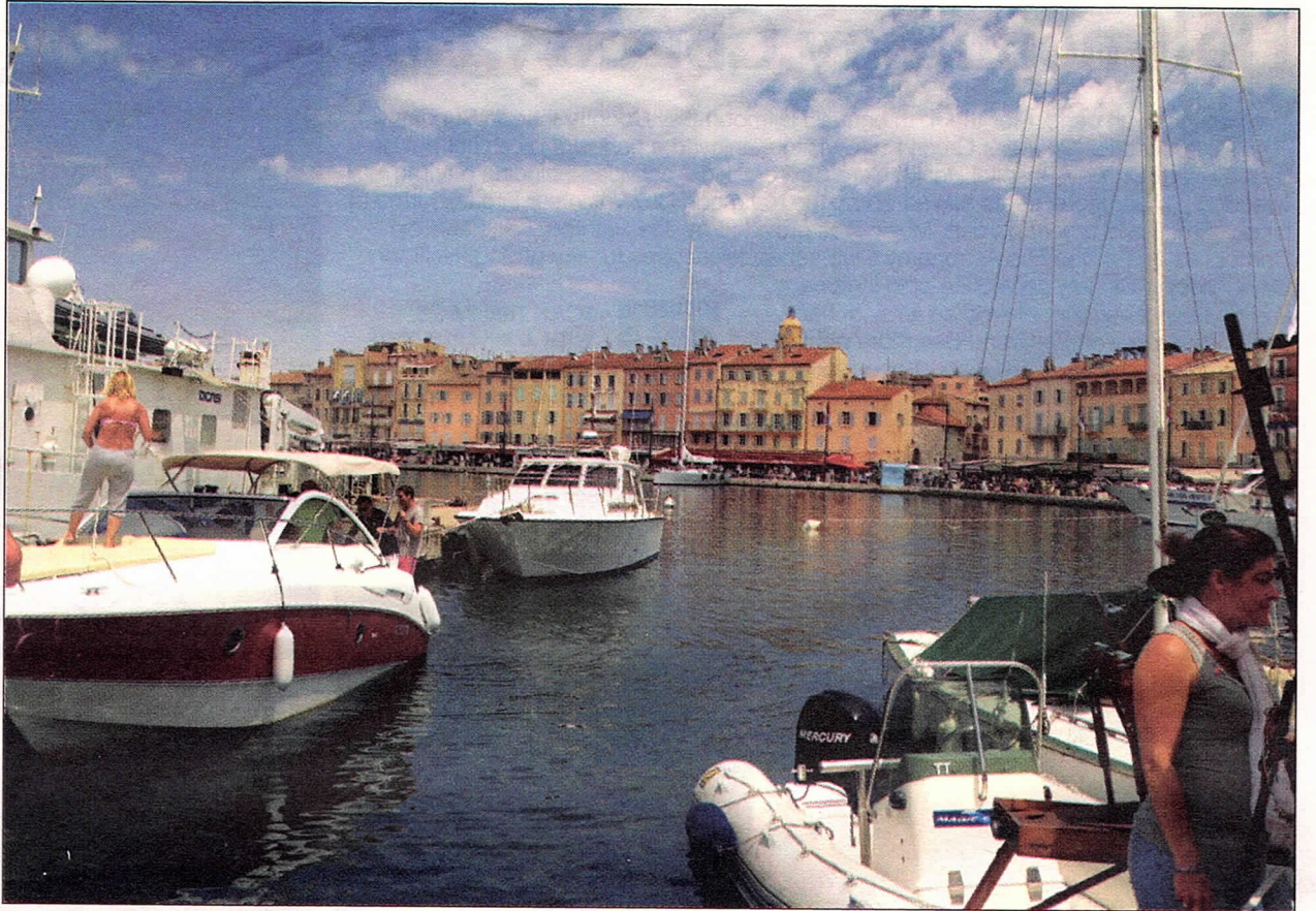
St. Tropez Harbour.