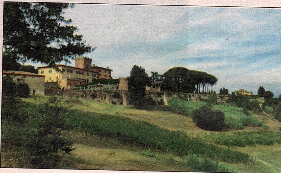
Central Tuscany is an agricultural area of great scenic beauty.

The next morning, I'm off to Siena, taking a pleasant drive through the countryside, dotted with castles and rolling vineyards, past San Gimignano to Monteriggioni, a fortified village whose encircling walls extend for 570 metres. Perched on a hill, it was originally built as a lookout post for the defence of the Val d'Elsa Valley. The walk